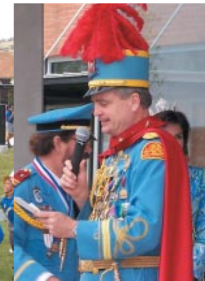
King Antonio speaks during TCA's annual Fiesta Celebration.