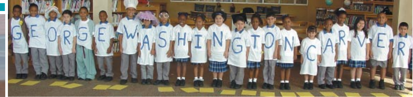
First and second grade students display their reading skills and creativity in the George Washington Carver readers' theatre.