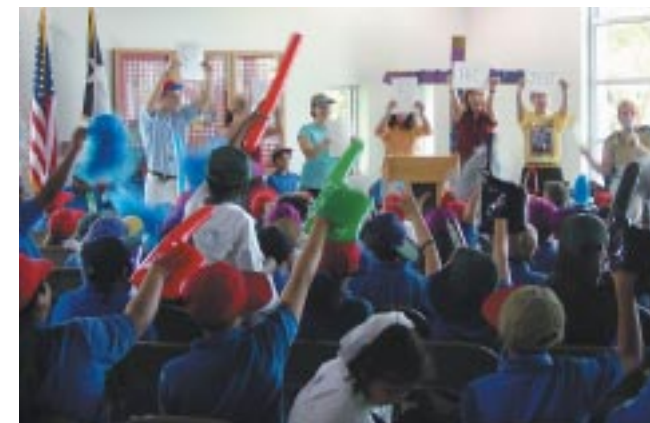
Students and faculty recently enjoyed a spirited afternoon pep rally as they prepared for the Stanford Achievement Test.