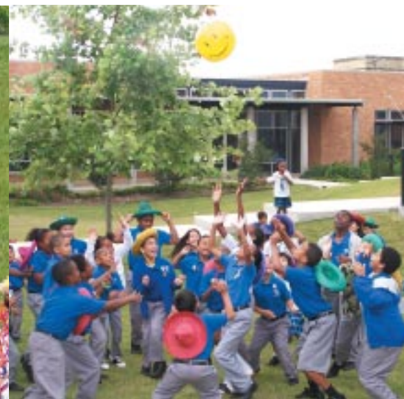
During Fiesta, The Carver Academy students enjoyed an enthusiastic game during the visit by Rey Feo.